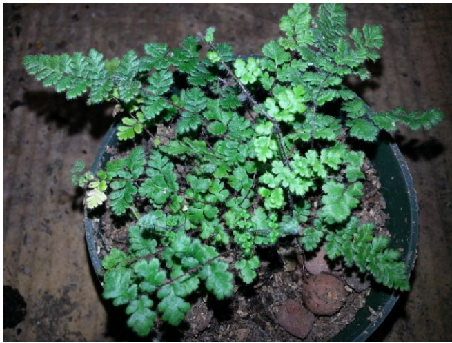
(1) Myriopteris lanosa