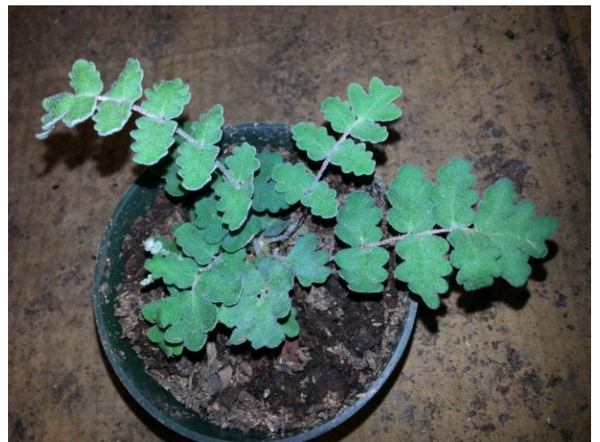
(4) Astrolepis sinuata