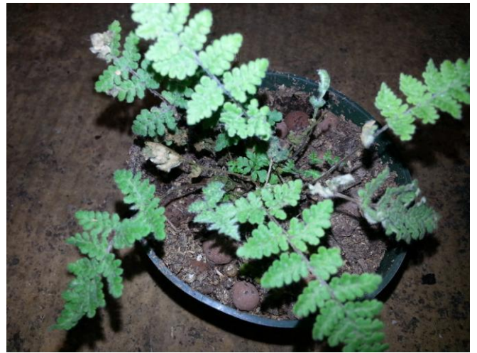
(2) Myriopteris tomentosa