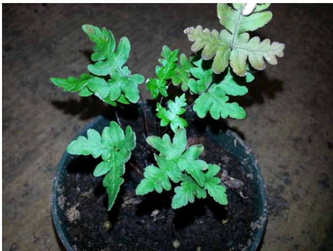
(3) Aleuritopteris argentea